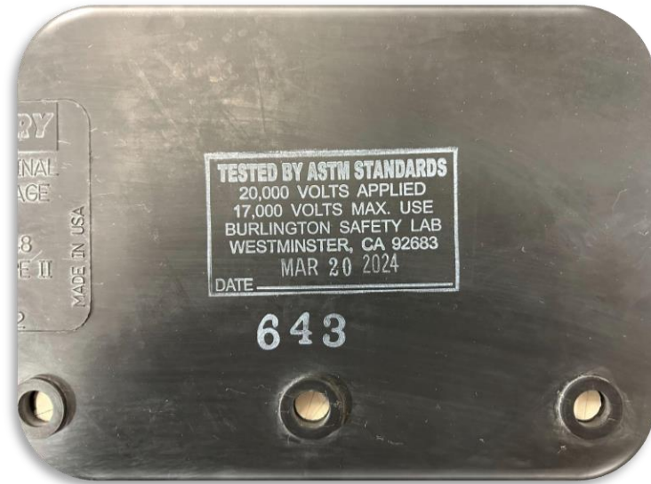
Figure 5 - Stamp