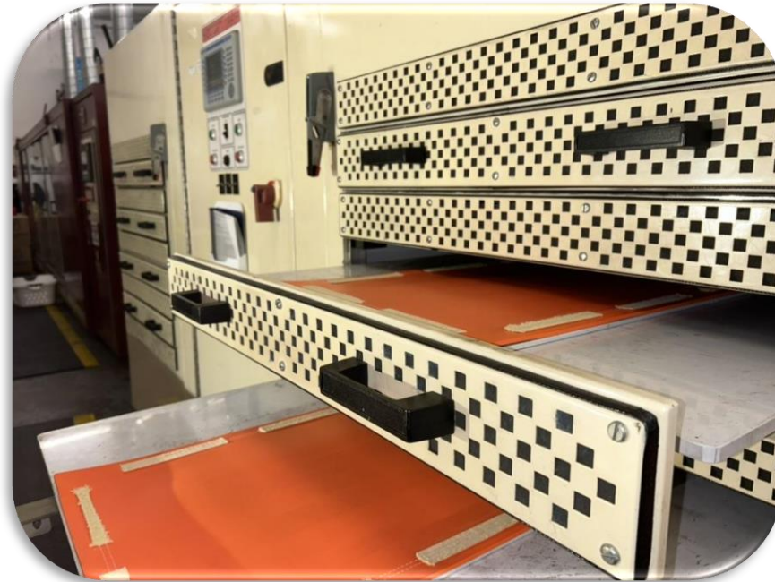
Figure 3 - Dielectric Testing of Blankets

sizes, providing comprehensive coverage for various requirements. Any detected dielectric failures are automatically identified by the machine, and appropriate actions are taken, including discarding, marking and returning, or replacing the blankets according to the customer's preferences.