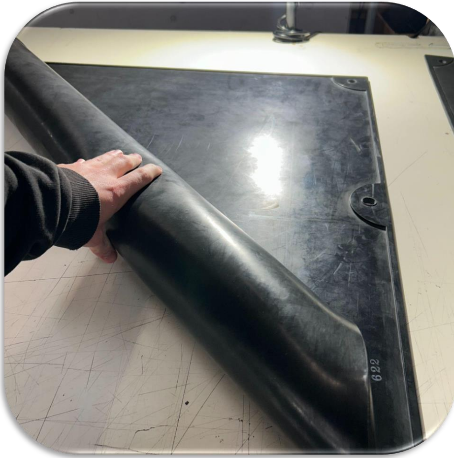
Figure 4 - Visual Inspection of Blankets