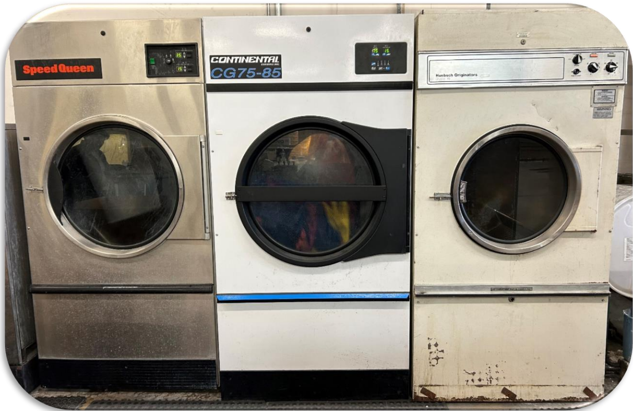
Figure 2 - Industrial Drying Machines

Following the washing phase, the electrically insulated blankets undergo a thorough drying process to ensure they are completely dry before proceeding to dielectric testing. This step ensures that the blankets are free from moisture, allowing for accurate testing of their insulation properties.