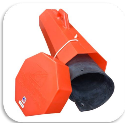
Figure 6 - Electrical Safety Blanket Canister

Following identification stamping, the electrically insulated blankets are rolled and stored in specially designed plastic canisters. This packaging solution not only ensures the protection of the blankets during transportation but also facilitates ease of handling. The canisters provide a secure and organized storage option, maintaining the integrity of the blankets until they are ready for use.