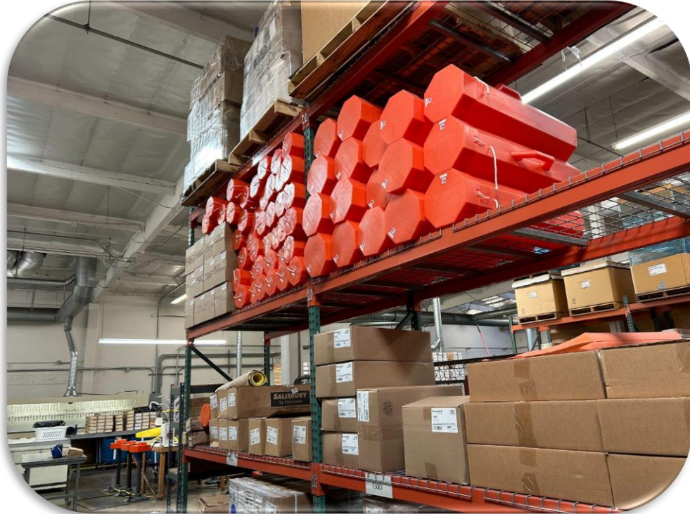
Figure 7 - Shipping or Pickup

The canisters containing the electrically insulated blankets are then either dispatched to the customer via UPS for delivery or made available for customer pickup, based on their preference. This ensures efficient delivery of the tested blankets to the designated recipients, facilitating their prompt integration into their operations.